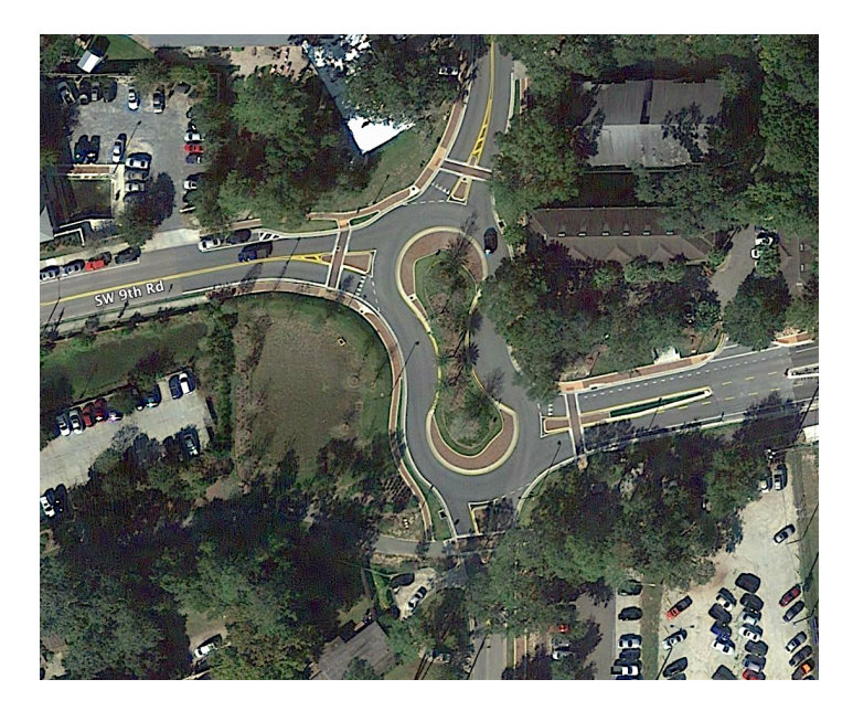
Rectangular roundabout in Cape Coral and a peanut roundabout in Gainesville