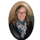
Dana Dahl Beach House Hotel