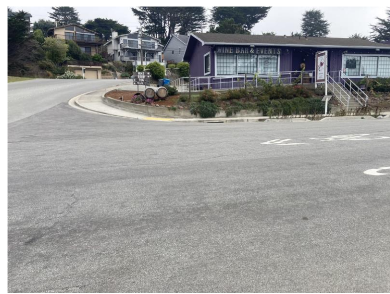
Carlos St & Etheldore St looking north