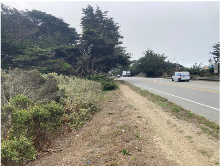
Northbound shoulder SR 1 near 16th St looking south