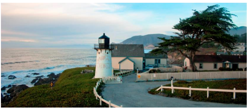
Early implementation project to come out of the Connect the Coastside