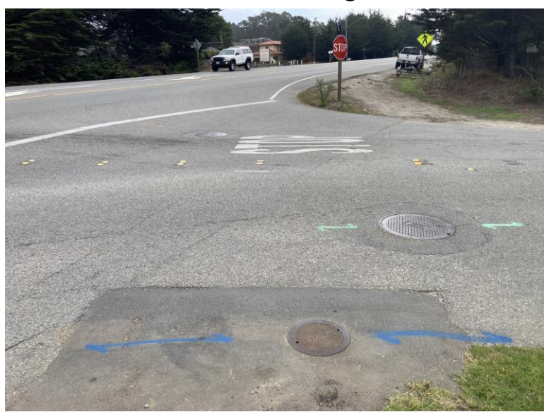
Cypress Ave looking south