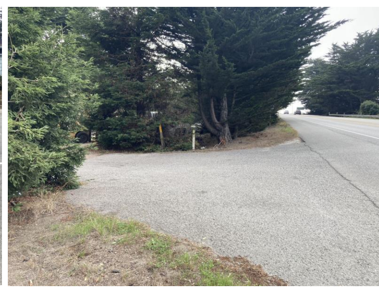
Driveway along northbound SR 1, south of Marine Blvd looking south